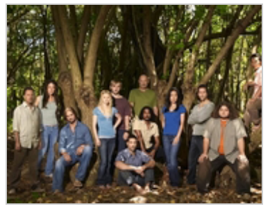
AP Photo: This 2006 photo, provided by ABC, shows the primary cast of the network's dramatic series...